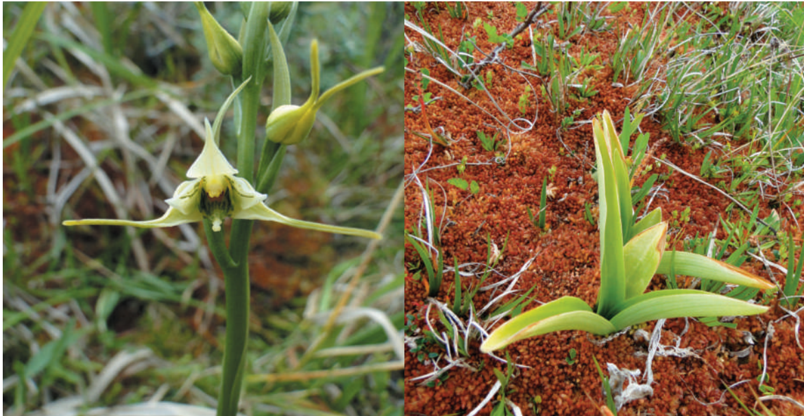
Figure 2. Gavilea araucana in inflorescence and vegetative state in a Sphagnum peatland in the Magallanes Region, Chile.

Sphagnum peatbog next to Torres del Paine National Park, represents the first record for Chile (Fig. 2). The orchids are growing from the Sphagnum carpet (lawns and hummock) reaching between 0.25 to 0.5 m tall. Several herbaceous species are coexisting under the Sphagnum magellanicum Brid domination, including Cortaderia egmontiana (Roem. & Schult.) M. Lyle ex Connor, Senecio trifurcatus (G. Forst.) Less, Symphyotrichum vahlii (Gaudich.) GL Nesom., Hypochaeris arenaria Gaudich, Marsippospermum grandiflorum (Lf) Hook., Tetroncium magellanicum Willd., and the carnivorous plant Drosera uniflora Willd. Rhizomatous species such as Myrteola nummularia (Poir.) O. Berg and Nanodea muscosa Banks ex C.F. Gaertn. with other woody plants such as Empetrum rubrum Vahl ex Willd and Nothofagus antarctica (G. Forst.) Oerstr were also present. In these environments S. magellanicum represents 70% coverage, and grows as hummock-lawns shape with at least a two-meter peat depth and a shallow water table. This finding may provide new information about habitat types for an orchid not previously described for the rest of the country. Research on peatlands in Chile are mostly focused on flora descriptions, but this is not an adequate characterization of these ecosystems, and further studies are required to describe and quantify the Sphagnum peatland flora. Therefore, the results of these studies would not show the cur-